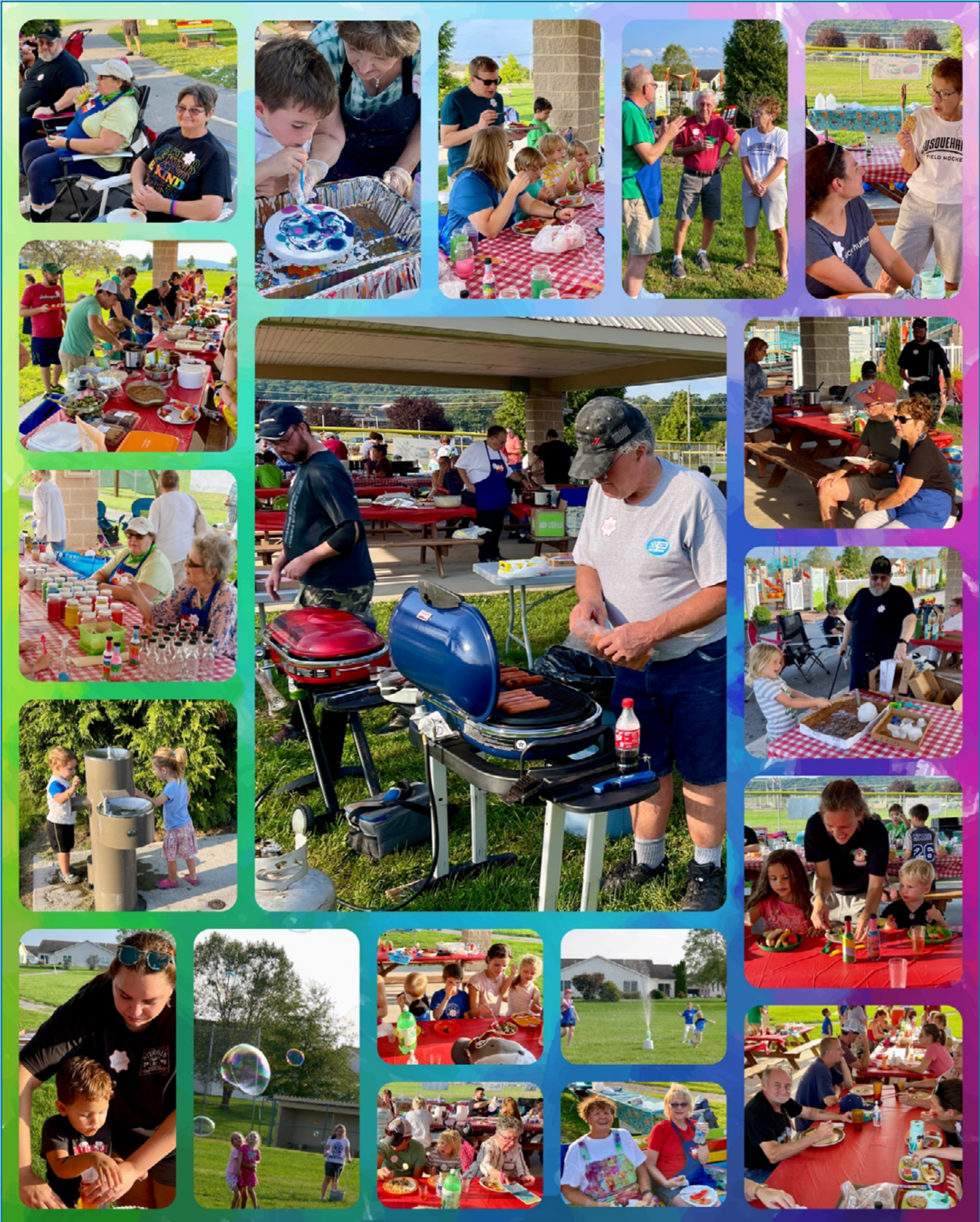
EVERYBODY HAD FUN AT ST. PAUL'S PICNIC AND MESSY CHURCH ON SEPTEMBER 18, 2022