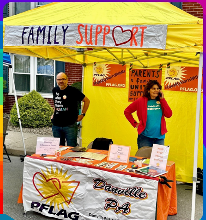
PFLAG had their first stand at the Selinsgrove Market Street Festival.