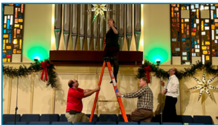
HANGING OF THE GREENS SUNDAY, NOVEMBER 26 AFTER WORSHIP

I'm excited for St. Paul's continuing to spread Jesus' Word and love to all in the coming year of 2024. When considering your personal giving commitment, please remember, 2 Corinthians 9: 6-8 says that each one of us should give what we have decided in our hearts to give, not reluctantly or under compulsion, for God loves a cheerful giver. There are many ways to say and many synonyms for the word "cheerful." So I ask that you please join me in renewing your personal giving commitment and be among the group here at St. Paul's of cheerful, enthusiastic, happy, jaunty, jolly, joyful, sunny and upbeat givers.