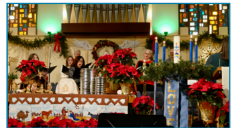
CHRISTMAS EVE DECEMBER 24 AT 4 P.M. AND 7 P.M.

Mark your calendar and join us as we share the joy of Christmas with members and friends of St. Paul's who are homebound and living in nursing homes. We will sing Christmas Carols with them. We meet in St. Paul's parking lot on Dec. 17 at 4 pm.