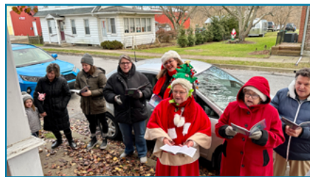
CAROLING SUNDAY, DECEMBER 17 AT 4 P.M.

Please help us decorate our sanctuary for the Advent and Christmas season. We need your help to hang garlands, stars, bows, decorate the Christmas Trees, communion table, the Advent Wreath and set up the nativities in the windows. Thank you for your help!