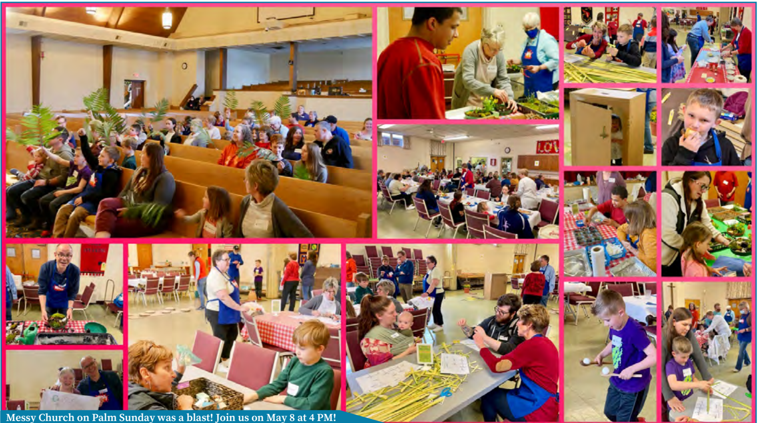
Messy Church on Palm Sunday was a blast! Join us on May 8 at 4 PM!