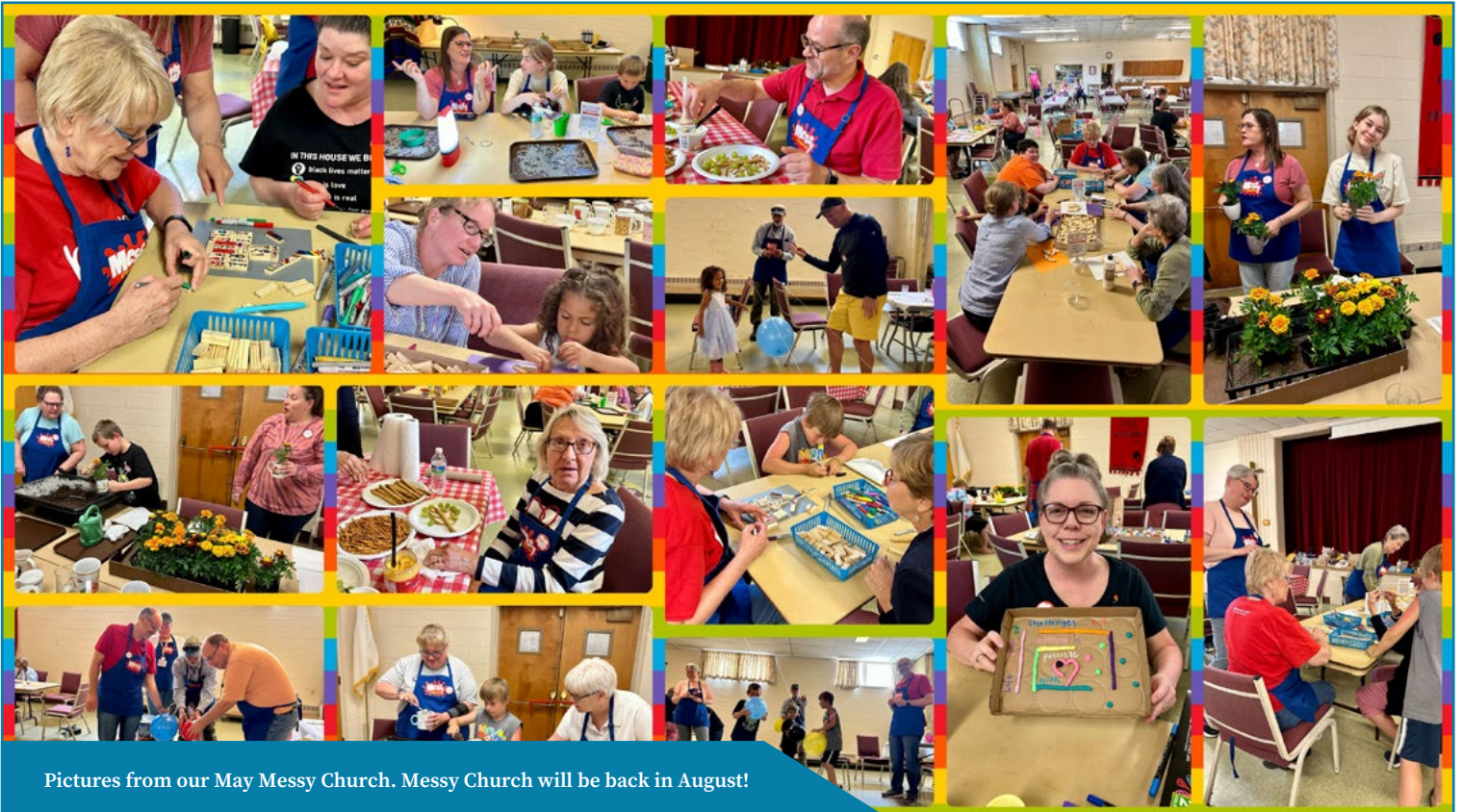
Pictures from our May Messy Church. Messy Church will be back in August!