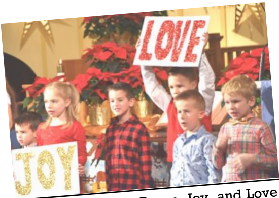
Presenting Hope, Peace, Joy, and Love are the children of the Joyful Noise Choir in worship on December 15.