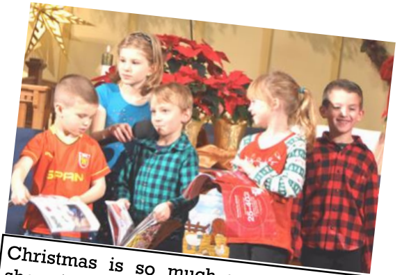
Christmas is so much more than gift shopping - Children present an Advent skit in worship on December 15.