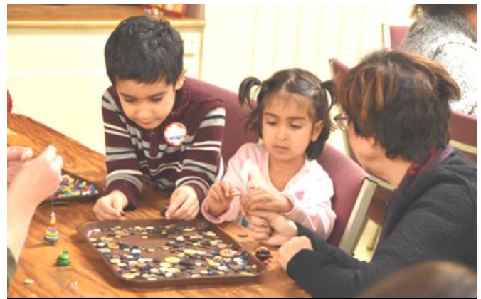
Crafting Christmas Tree ornaments from buttons at Messy Church.