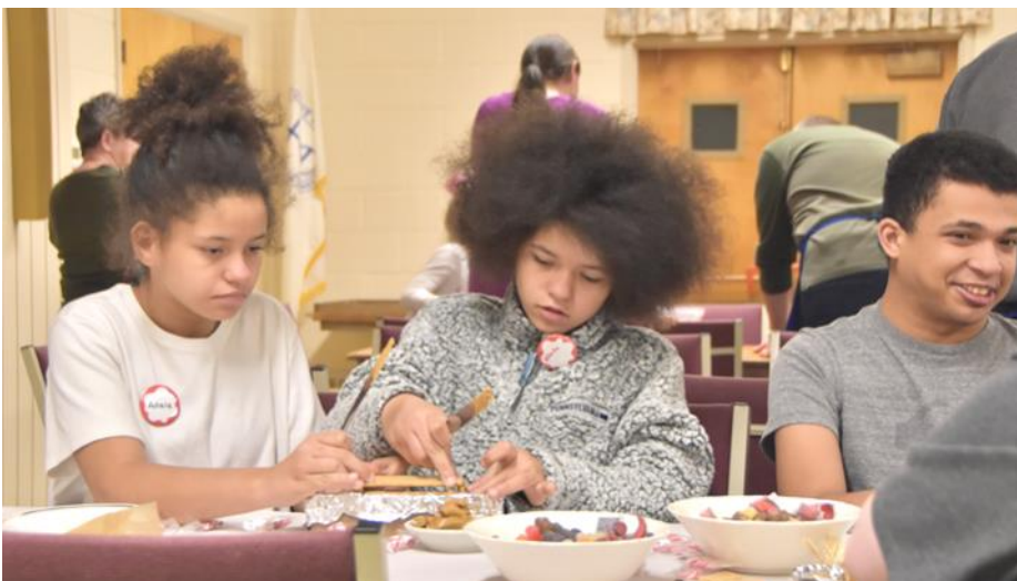
Crafting an edible nativity at Messy Church on December 1.