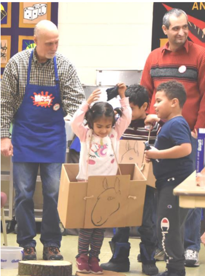
Participating in the obstacle course, "The Journey to Bethlehem" at Messy Church on December 1.