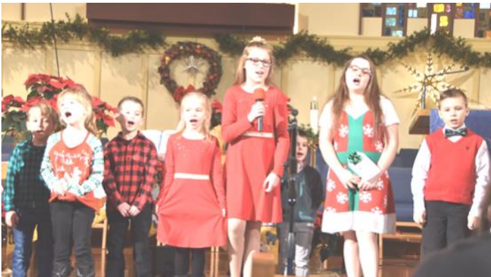
Joyful Noise Choir children share the message of Advent in worship during their musical presentation on December 15.