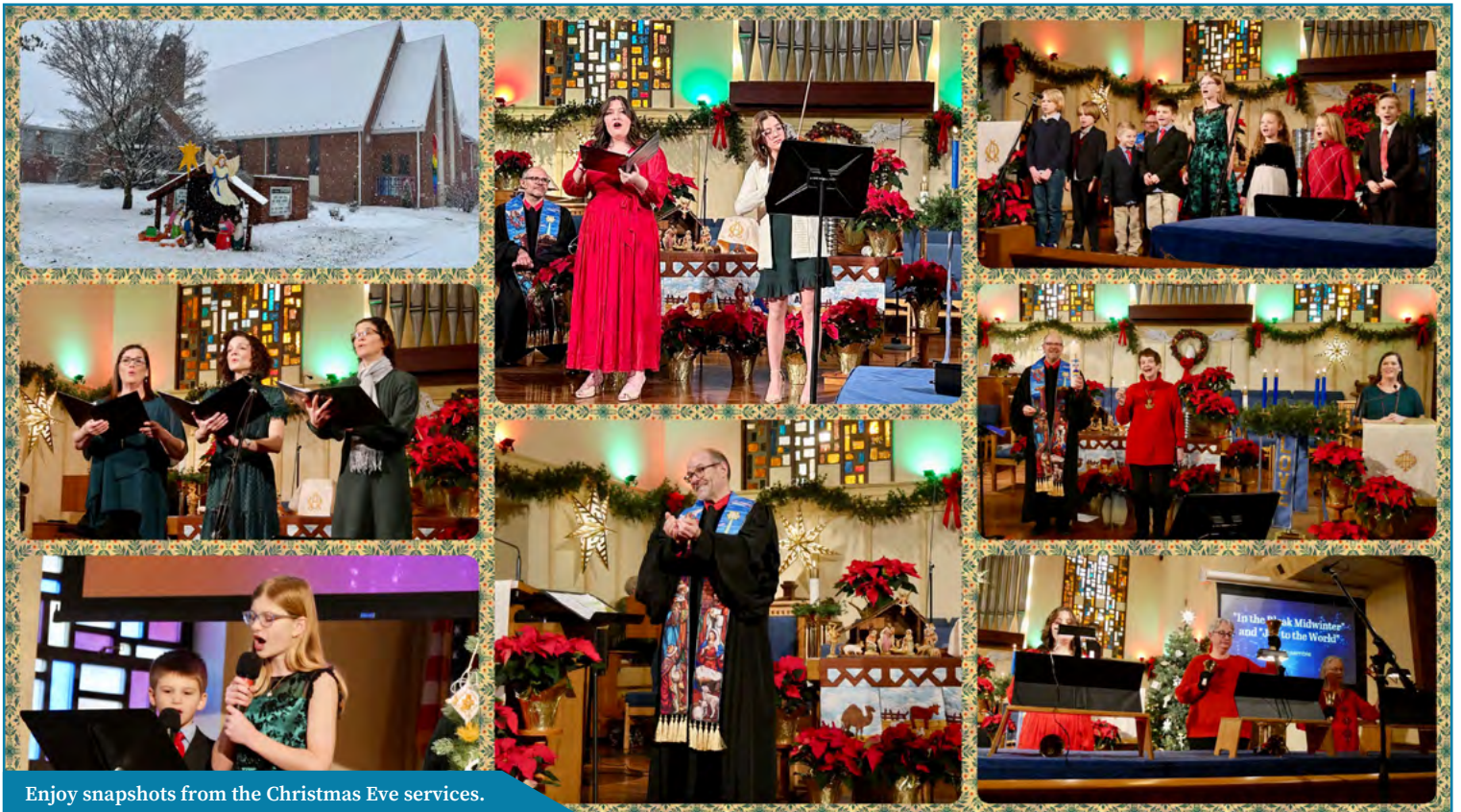
Enjoy snapshots from the Christmas Eve services.