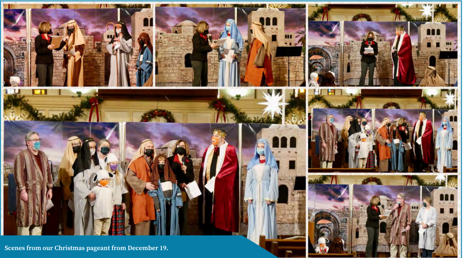
Scenes from our Christmas pageant from December 19.