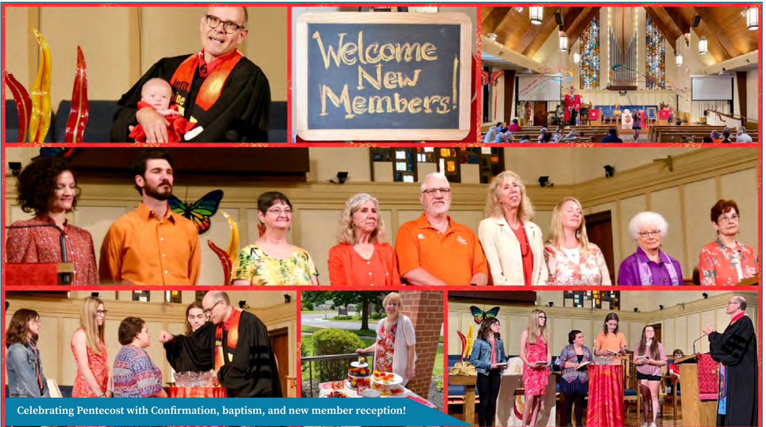
Celebrating Pentecost with Confirmation, baptism, and new member reception!