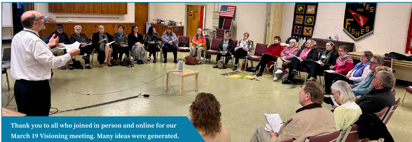
Thank you to all who joined in person and online for our March 19 Visioning meeting. Many ideas were generated.

It was amazing! I did sense much positive energy, great ideas, and a “we-can-do-this” attitude at our second visioning event after worship on Sunday, March 19. Thanks to all who participated in person and online. We had 33 persons present.